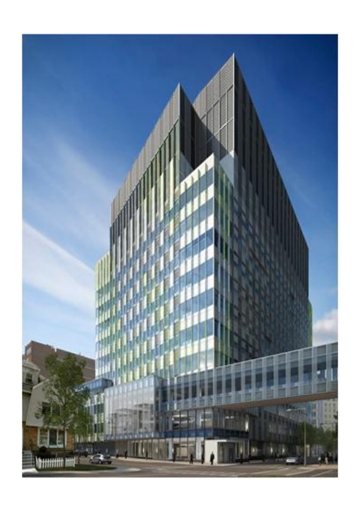
The Building for Transformative Medicine

The new Orthopaedic and Arthritis center moved from 45 Francis Street to 60 Fenwood Road in the new Building for Transformative Medicine on October 3, 2016. We look forward to seeing you at our new location.